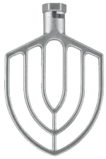
WSM10LMP Aluminum Mixing Paddle