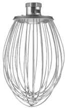
WSM20LW Stainless Steel Chef's Whisk