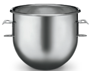
WSM20LBL 20-Quart Stainless Steel Bowl

Special shipping requirements needed. Machines ship in large wood crates via courier service.