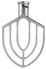
WSM20LMP Aluminum Mixing Paddle