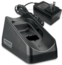
WSB38XCS 1.5-Hour Quick-Charging Station