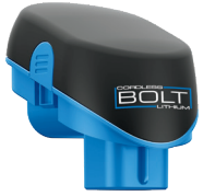
WSB38XBP Battery Pack