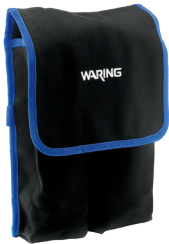
WSB38XSC Storage/Transport Case