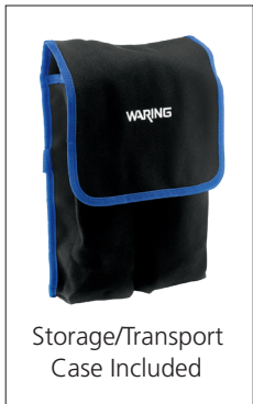
Storage/Transport Case Included