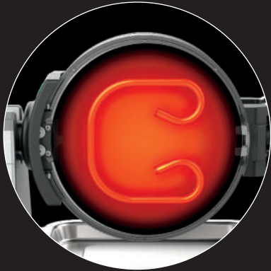
Embedded Heating Element For Precise Temperature Control