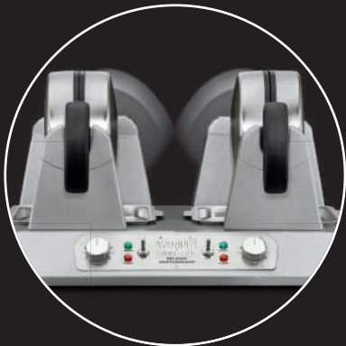
Rotary Feature For Even Baking And Browning